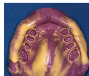
Figure 9: Inspect your impression.