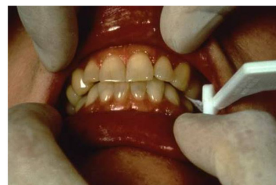
Figure 4: Maintain centric position.