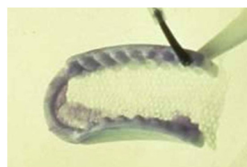
Figure 2: Tray adhesive.