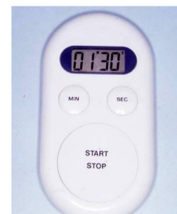
Figure 5: Use a timer.