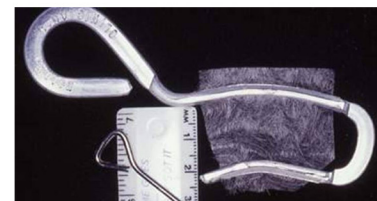
Figure 1b: Wide arch.