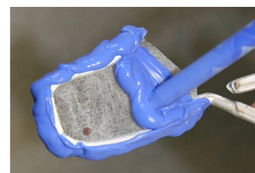
Figure 3: Cover the side walls.