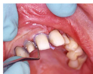
Figure 8: Pack cord.