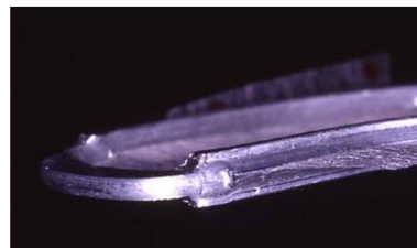
Figure 1a: Low side walls.